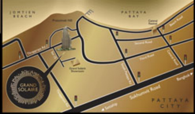
Grand Solaire, Soi 15, Thappraya Road, Pattaya City, Chonburi 20150