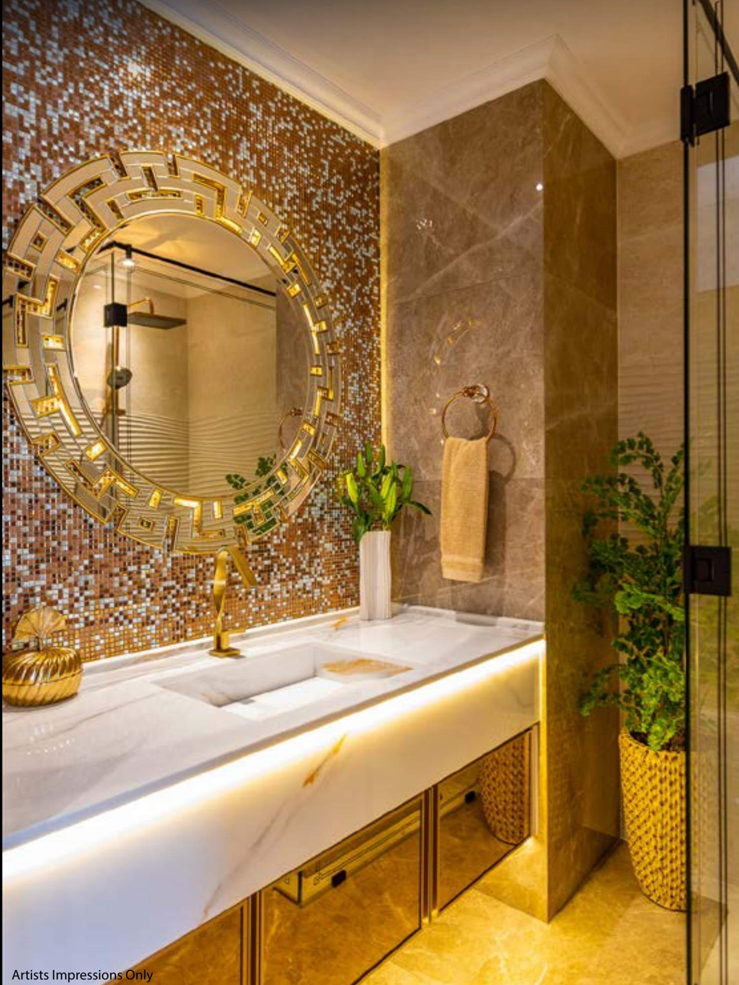
DESIGN & TONE OF LIKELY Finish (The Riviera Malibu Showroom)